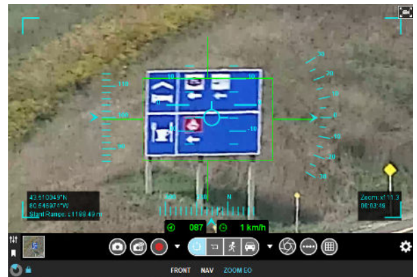
Zoom performance: Comparative imagery across 1x, 30x, 120x zoom range